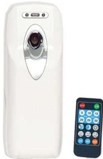
Wall Mounted Fragrance Dispenser AF-300 with Aerosol Can