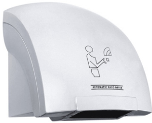
Automatic Hand Dryer ABS Body HD-1800 EA