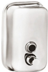
Manual Soap Dispenser SS Body (500 ML) MSD-500