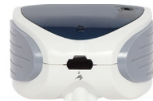
Automatic Soap Dispenser Polycarbonate ABS Body (500 ML) SD-500