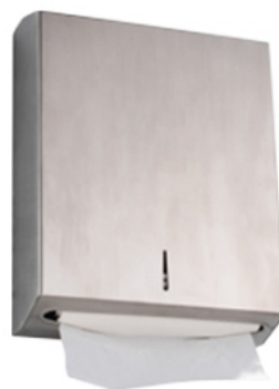
Tissue Paper Dispenser SS 304 (C Fold/ M Fold) TS-400