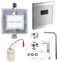
Automatic Urinal Flusher (Concealed) U-612S