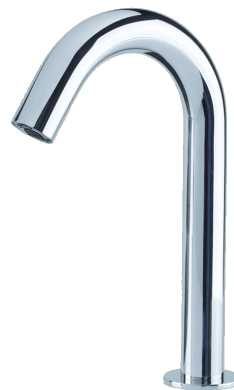
Contactless Sensor Tap (Basin Mounted) T-104