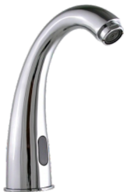
Contactless Sensor Tap (Basin Mounted) T-102