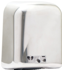
Automatic Hand Dryer Stainless Steel Body HSD-600