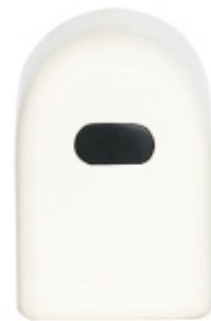
Automatic Urinal Flusher (Exposed) U-2024