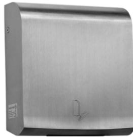
Automatic Slim High Speed Hand Dryer SS Body HSD-700