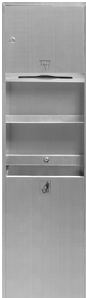
Recess Panel 2-IN-1 with Tissue Paper Dispenser + Waste Receptacle in SS 304 Body