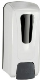
Manual Soap Dispenser ABS Polycarbonate Body (1000 ML) M-1000