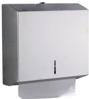
Tissue Paper Dispenser SS 304 (C Fold/M Fold) SUS304 Eco