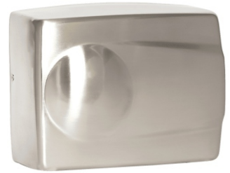
Automatic Hand Dryer MS Body SS Finish HD-2800