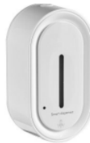
Automatic Soap Dispenser Polycarbonate ABS Body (1000 ML) A-1000