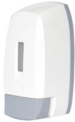
Manual Soap Dispenser ABS Polycarbonate Body (600 ML) M-600