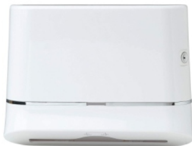
Tissue Paper Dispenser ABS Body (C Fold/M Fold) TS-200