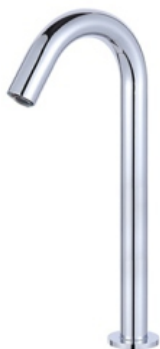
Contactless Sensor Tap (Counter Mounted) T-106