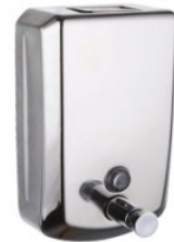
Manual Soap Dispenser SS Body (500 ML) MS-500