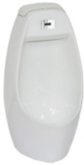
Wall Mounted Urinal Pot Indian Sensor NH-EFS