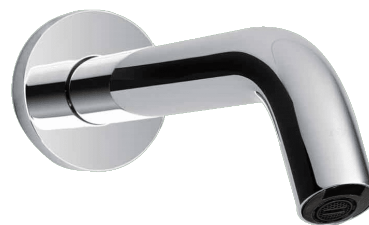
Contactless Sensor Tap (Wall Mounted) T-108