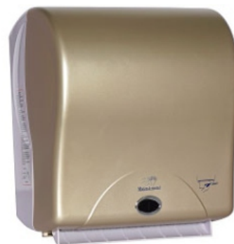
Autocut Tissue Paper Dispenser TS-611