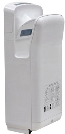
Automatic Jet Hand Dryer ABS Body HD-7000