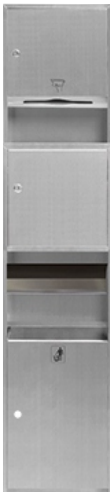
Recess Panel 3-IN-1 with Hand Dryer + Tissue Paper Dispenser + Waste Receptacle in SS 304 Body