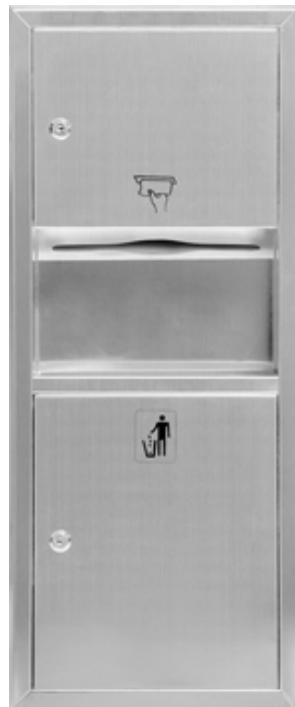
Recess Panel 2-IN-1-A with Tissue Paper Dispenser + Waste Receptacle in SS 304 Body