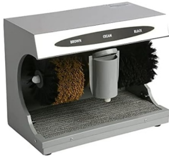
Automatic Shoe Shiner Machine SSM-01