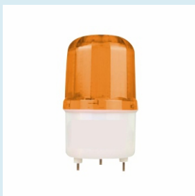
Alarm Flash Lamp