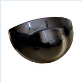
Overhead Motion Sensor

Parts, Spares, Accessories and other items of Entrance Systems