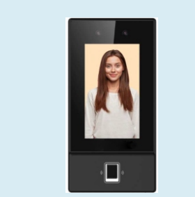
Access Control System