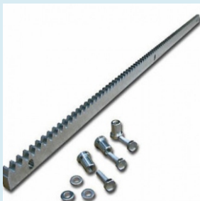
MS Rack with Studs