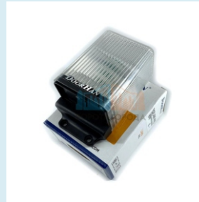
Blinker and Flasher