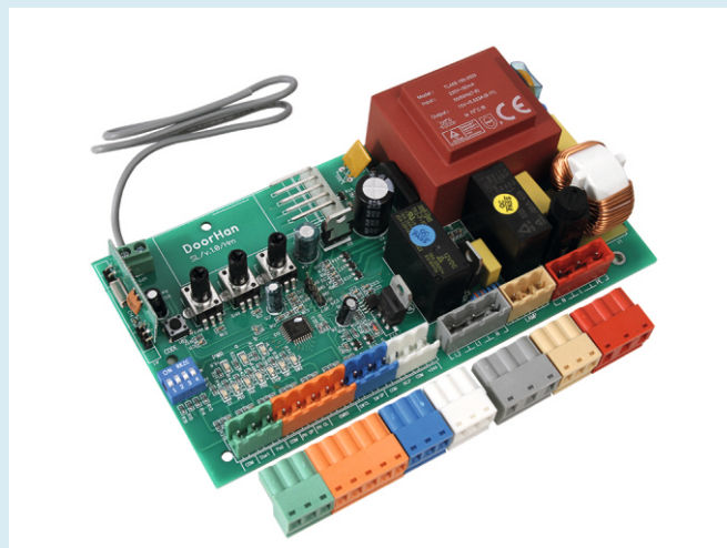
All Kinds of Control Cards Circuit