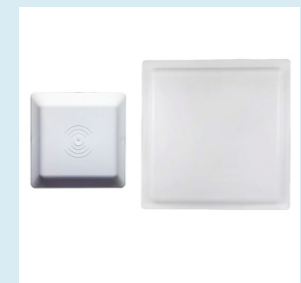
Long Range Distance Reader